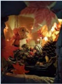
Signs of Autumn have reached classrooms

This information is also repeated in a section below just to be sure it's not missed!