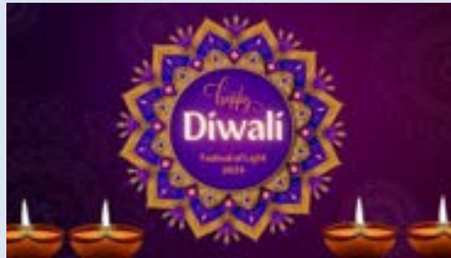
Wishing those who are celebrating a happy and prosperous Diwali