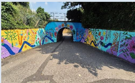
Year 6 Mural Workshop

It was also positive to see how many parents and carers were able to attend the 'Meet the Teacher' sessions on Wednesday. I know the teachers were glad to meet you and start to build the all-important home-school relationship. Thank you for coming!