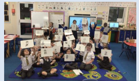
1C created jellyfish ready for their new topic

I am hopeful that all parents and carers received the letter regarding attendance that was shared with you all on Monday. If you have not read this carefully, please do so.