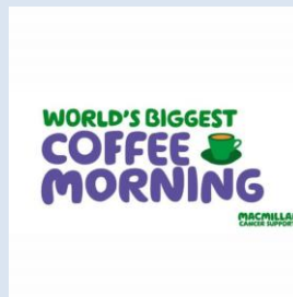
Join us for coffee morning on Thursday 19 th Sept