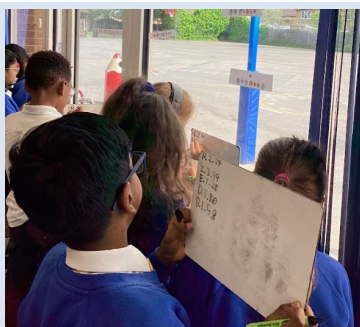
Maths with Year 4

We are beginning our plans for induction across the school – including welcoming our new Reception children. We are also beginning our work with the local secondary schools in preparing the Year 6 children for the next stage in their schooling. Whilst there is still a lot of the school year left – we will be thinking carefully how best to make the children's final term at Riverbridge as smooth as possible.