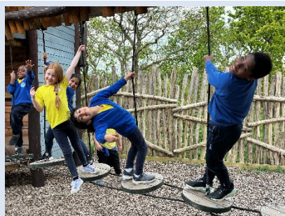
Year 2 Hobbledown visit