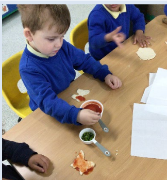
Nursery making butterfly pizza

What a fabulous school you have, full of teachers that have a real passion for what they do!’