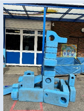
ASC's dinosaur sightings

The drainage work at KGB remains on track to be finished before the half term holiday. Thank you for the patience and flexibility you have shown here. I will, however, draw your attention to a section below about a car that was driving along the pavement and nearly hit a child this morning. Whether this was a Riverbridge parent or not – this is obviously dangerous driving and a potential police matter. Please be considerate and safe when driving around the school sites. Thank you.