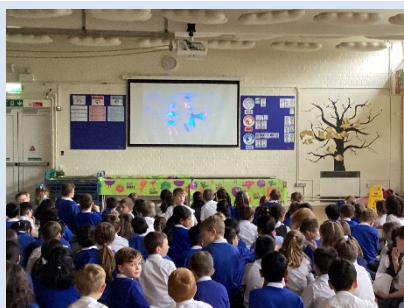
Hot Dog Night at PAB