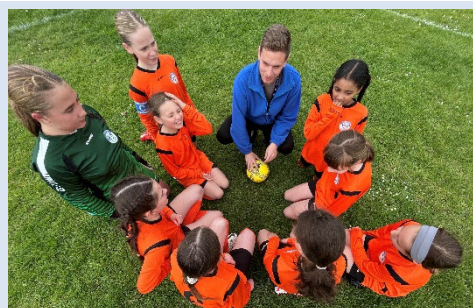
Girls' Football team secured silver

From everyone at Riverbridge, we wish Miss Loky good luck!