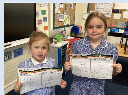
PSHE in Year 3