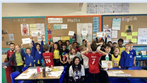
NSPCC Digits Day