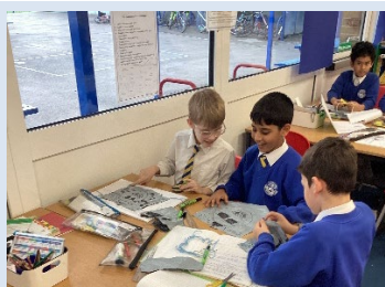
5G collaborating during science

Next week will be an important one as we host the second parents and carers consultation meetings. I am hopeful that you will all have booked these important meetings already but if not – there is still time to contact the office on Monday to do so. Thank you in advance.