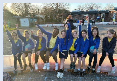
Our netball team

There is a section below which mentions the Times Tables Rock Stars battle taking place in Year 4 across the Lumen Trust and I am able to share the definitive results.