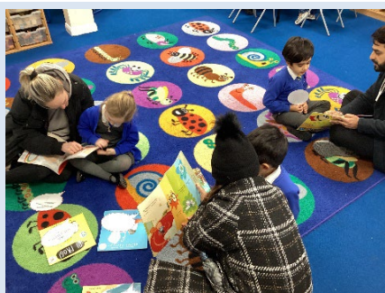
Year 1 Stay and Learn Sessions

Finally – thank you to all the parents and carers for coming to support and help make this week such a memorable one.