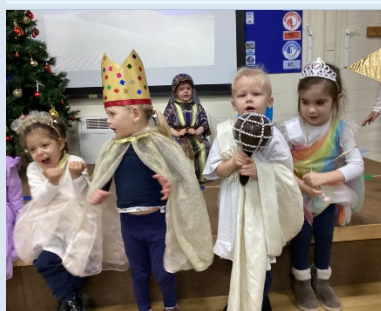
Hedgehogs' Christmas performance