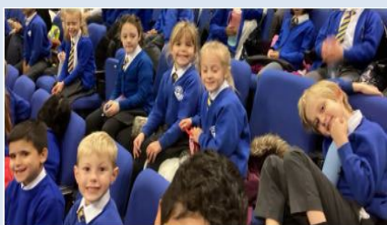
Year 2 were treated to a Pantomine yesterday

Whatever the weekend brings for you – I hope it is a positive one!