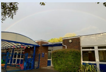
A rainbow over Riverbridge this morning