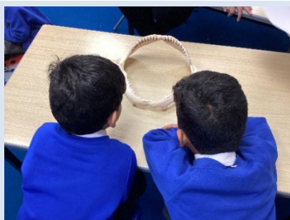
1L's close encounter with a shark

Another need for patience is when picking up from the classroom doors on both sites. Class teachers will recognise the vast majority of parents and carers quite quickly but there are times when the password list needs to be referred to. The class teacher has a responsibility in this instance to do this job carefully and accurately. The priority is not to do this so quickly that mistakes are made. I am sure that all parents, carers and extended families will understand the safeguarding implications here.