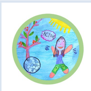
Being Active - One of Our 8 Great Ways Of Being Our Best